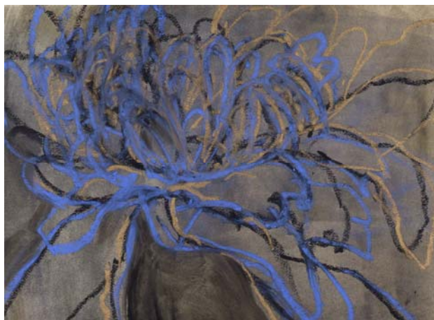
Chrysanthemum 48 , 1995, Oil stick on paper, 22 x 30 inches